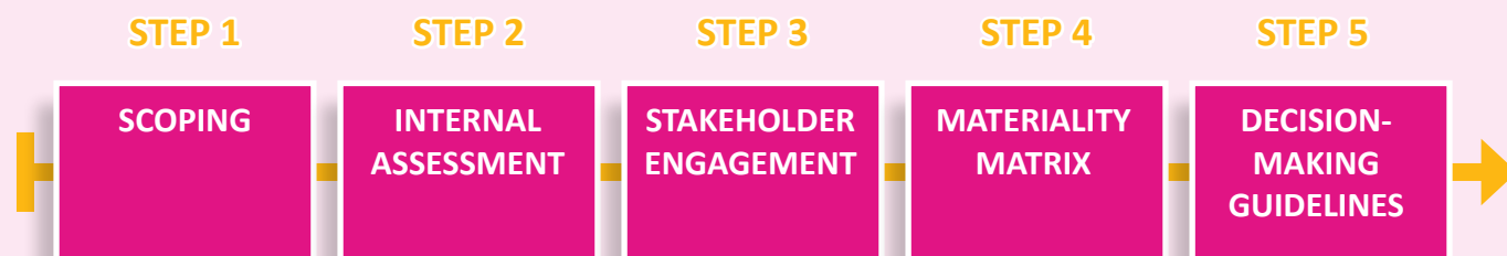
Figure 1: The approach of the Biodiversity Risk Scan